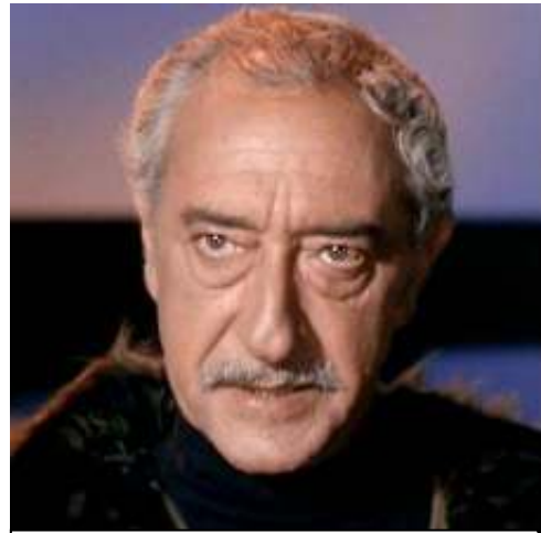
TOS: "The Conscience of the King" Anton Karidian (aka Kodos the Executioner) actor Arnold Moss http://images.wikia.com/memoryalpha/en/images/e/eb/Anton_Karidian.jpg

supply. Kodos applied his own selection process to exterminate half the citizens to save the other half. He was later confused with a burned body and presumed dead. Kirk suspected a Shakespearean actor, Anton Karidian was Kodos the Executioner.