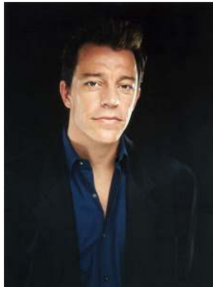
Michael Wiseman publicity photo: http://ia.imdb.com/media/imdb/01/1/88/10/98f.jpg