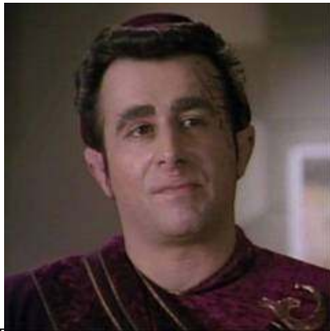
TNG: "The Most Toys" Saul Rubinek as Kivas Fajo

When Varria attempted to help Data escape, Fajo killed her with a Varon-T Disruptor. Witnessing the act, Data prepared to kill Fajo with the Disruptor. Fortunately for Fajo, Data was transported to the Enterprise just as he opened fire and Fajo's life was spared. Fajo was later arrested and his collection was confiscated.