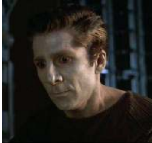
VOY: "Revulsion" Dejaren, a psychopathic hologram played by Leland Orser. http://images4.wikia.nocookie.net/memoryalpha/en/images/9/9c/Dejaren.jpg

Holographic psychopath: Not to be outdone by TOS and TNG, Voyager's "compelling character" is Dejaren, a Serosian HD25 Isomorphic Projection, otherwise known as a sentient hologram. However, this one's programming has gone awry and kills six members of Voyager's crew by flooding a lower deck with radiation.