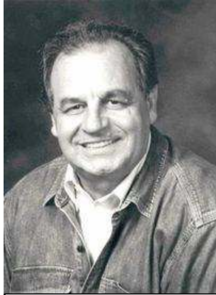
Paul Dooley