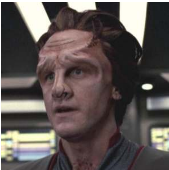
VOY: "Riddles" Mark Moses as Naroq, a Kesat.