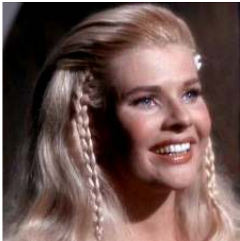
TOS: "The Conscience of the King" Lenore Karidian; actress Barbara Anderson

To be... or not to be... In the TOS episode, Conscience of the King, Kirk recognizes a well-known Shakespearean actor as Kodos the Executioner. Governor Kodos governed the Tarsus IV colony circa 2246, at which time a deadly fungus destroyed the colony’s food