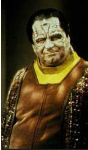
DS9: 4 episodes Paul Dooley as the Cardassian, Enabran Tain, former head of the Obsidian Order http://www.ex-astris-scientia.org/gallery/stmagazine/garak-tain.jpg