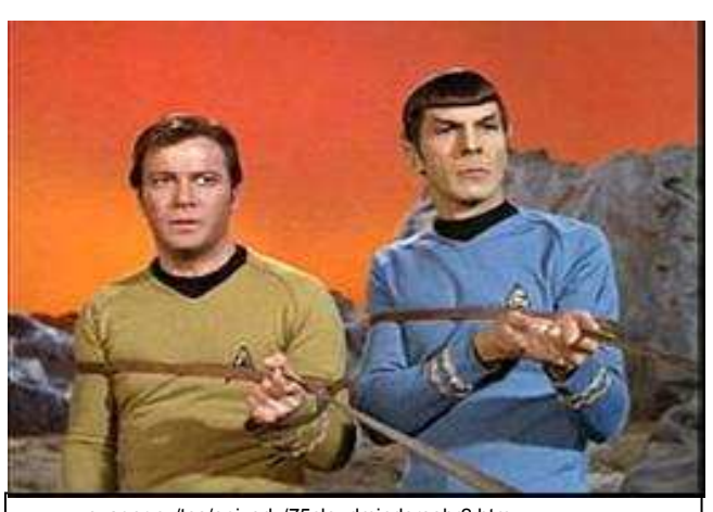
www.voyager.cz/tos/epizody/75cloudmindersobr2.htm The Cloud Minders: Kirk and Spock are tied a bit tied up.