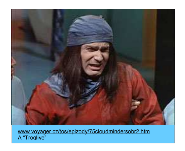
Theme 1: The haves vs the have nots