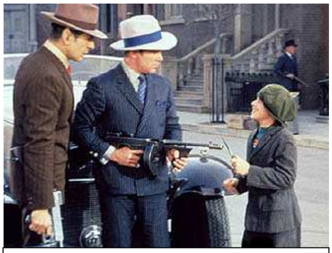
www.startrek.com Kirk and Crane love their guns.

Seems Kirk and Spock find themselves tied up in The Cloud Minders. At least they're in a vertical position.